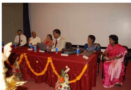
The Inauguration of the Annual CME